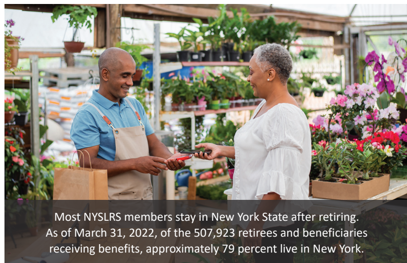
Most NYSLRS members stay in New York State after retiring. As of March 31, 2022, of the 507,923 retirees and beneficiaries receiving benefits, approximately 79 percent live in New York.

After a career of public service, NYSLRS retirees continue to contribute to New York — not just as consumers, but as engaged citizens and individuals who bring value to the communities where they live.