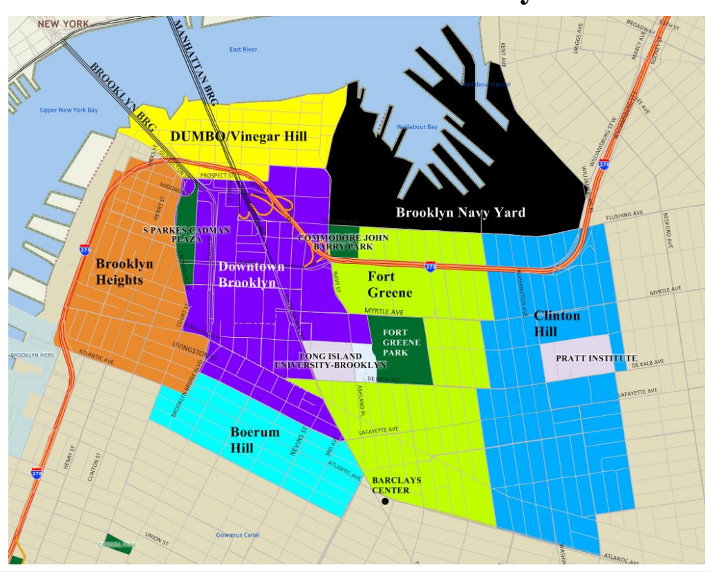
Figure 5 The Greater Downtown Brooklyn Area

Major retail corridors in the area include the Fulton Mall, a 17-block major shopping district, with over 150 stores and restaurants, running along Fulton Street from Adams Street to Flatbush Avenue, as well as the Atlantic Center Mall and the neighboring new Atlantic Terminal Mall.