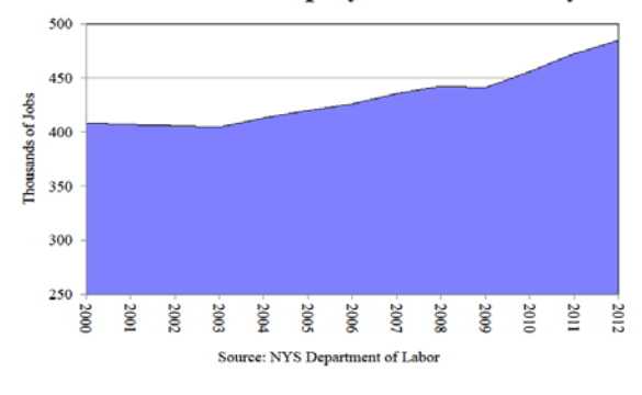
Figure 1 Private Sector Employment in Brooklyn

Private sector employment in Brooklyn increased by 19.8 percent between 2003 and 2012, <sup>1</sup> a faster rate of growth than in any other borough and nearly twice the rate of growth in the rest of the City (10.6 percent). In 2012, private sector employment reached 484,560 jobs (see Figure 1), the highest level on record. While data for the full year are not yet available, the rate of job growth picked up in 2013 and the number of private sector jobs exceeded 500,000 in the third quarter.