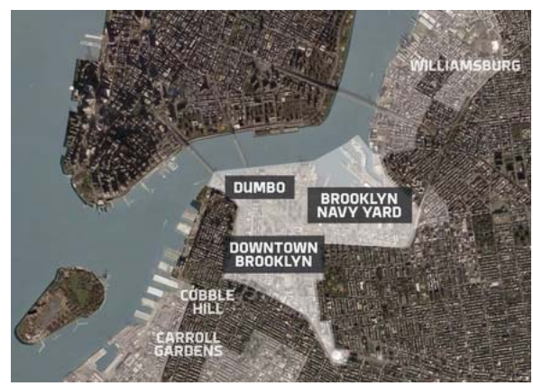
Figure 3 The Brooklyn Tech Triangle

is seeking more commercial space, and public and private investments to support future growth.