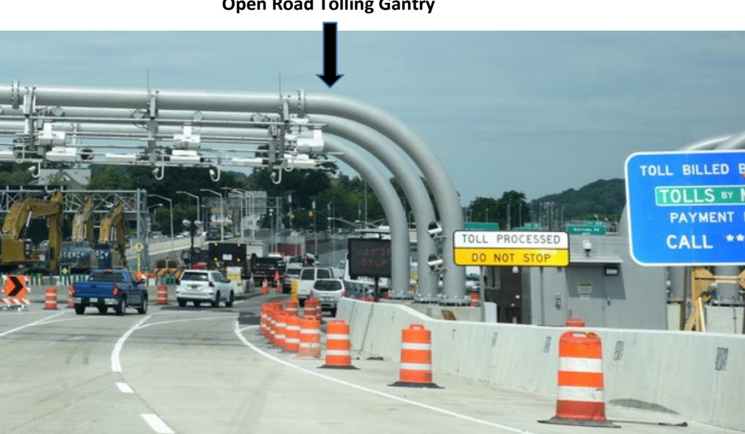
Open Road Tolling Gantry

customers to either prepay their tolls or automatically have tolls charged to a checking account at the end of the day. As of November 2016, the HHB moved to the Open Road Tolling (ORT) system; the toll booths and gates were removed and a gantry system was installed, meaning drivers no longer needed to slow down.