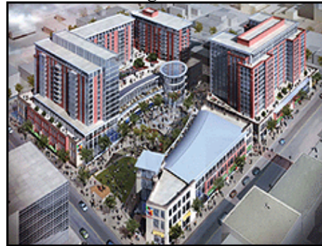
Figure 5 Flushing Commons