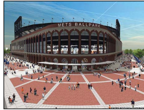
Figure 7 Shea Stadium