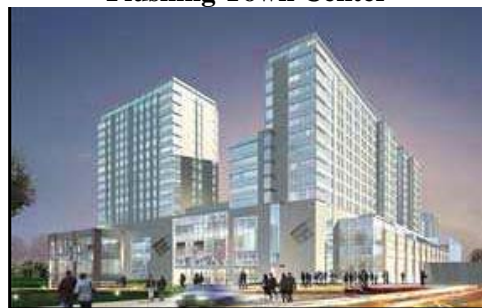
Figure 6 Flushing Town Center